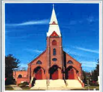
Saint Joseph Church 1747 Poquonock Avenue Poquonock, CT 06064