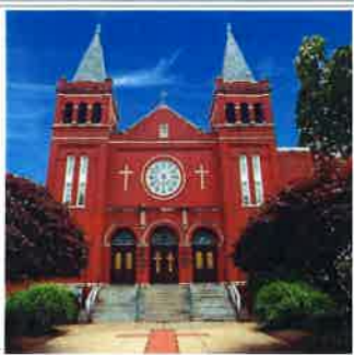
Saint Gabriel Church 379 Broad Street Windsor, CT 06095